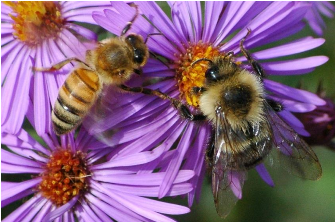
Honeybee ( Apis mellifera ) and Bumble bee ( Bombus impatiens ) on New England aster.