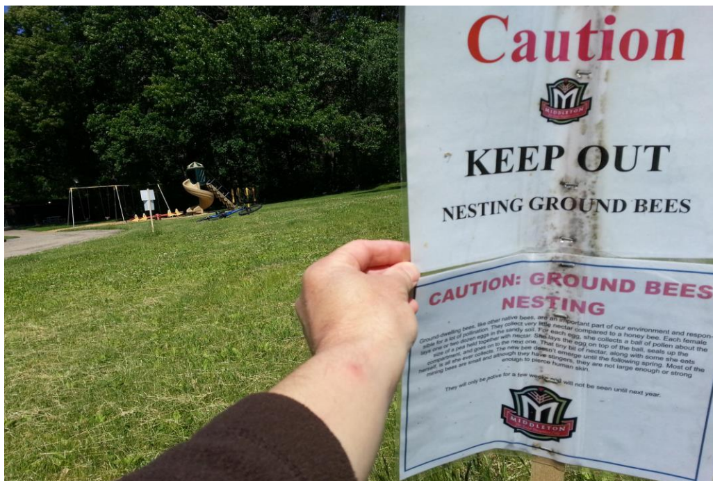
Middleton Parks Dept. notice of ground-nesting bees at Parisi Park, adjacent to Pheasant Branch Conservancy. Ground-nesting bees are not aggressive and are active as adult bees for only a few weeks of the year.

Support evaluation of, and progress in, achieving Task Force goals. At annual meetings, county department personnel, municipal representatives, scientists and the public will share lessons learned and plan future pollinator protection initiatives.