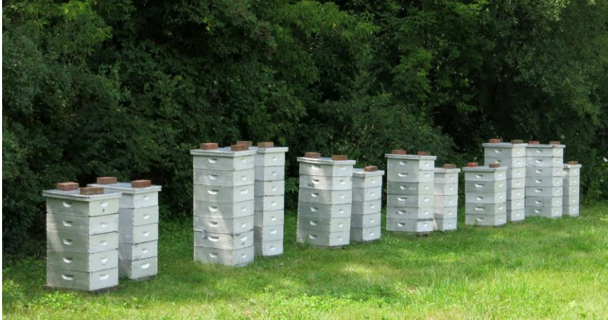
Honeybee hives in Dane County